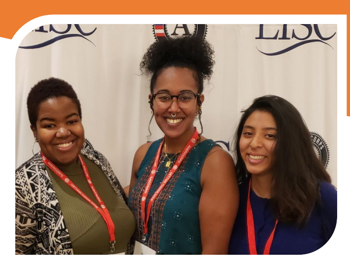
LISC AmeriCorps members attending the 2019 LISC AmeriCorps Leadership Conference in Jackson, MS