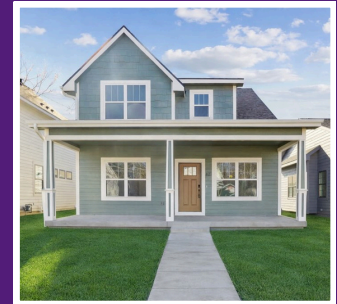
421 E GRANGER AVE DES MOINES, IA 50315