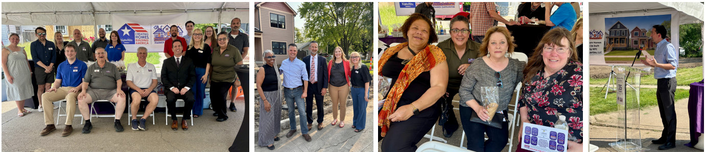
35th Anniversary Celebration in Des Moines - June 2, 2025

Thank you for standing with us and believing in our mission over the past 35 years.