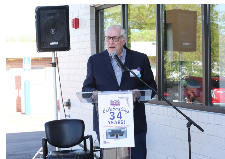
Des Moines Office Ribbon Cutting Open House - May 7, 2024