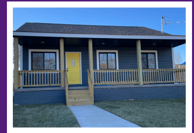
1306 E 15TH ST, DES MOINES, IA 50316

NFC Properties, LLC is a subsidiary of NFC that purchases and renovates homes and builds new construction homes that are sold to homebuyers in our Des Moines Lending Area. For 16 years, NFC Properties has been providing quality homes in the neighborhoods we serve.