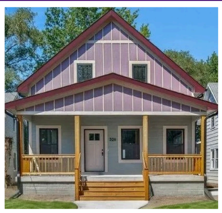
326 E GRANGER AVE, DES MOINES, IA 50315

7 NEW CONSTRUCTION HOMES BUILT IN 2024 1 HOME RENOVATED IN 2024 8 NFC PROPERTIES HOMES SOLD IN 2024